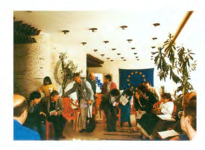
One of the Pan-European seminars

The target groups of the League are public authorities, opinion leaders, educators, politicians, mass media representatives and, generally, all those pertaining to the category of multipliers.