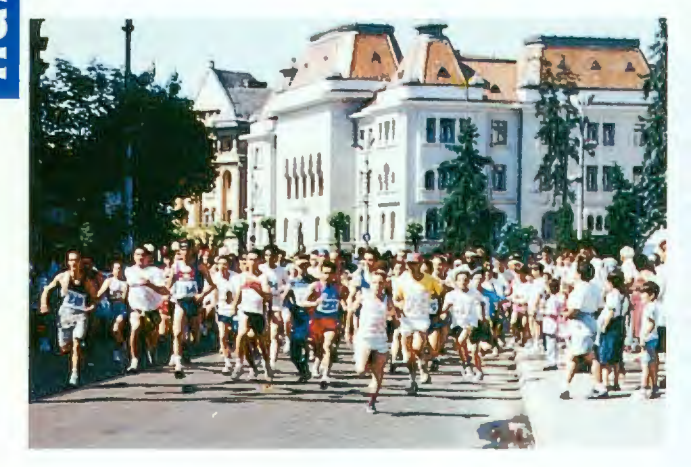
"Pro Europa" Cross, 1996

The Human Rights Office, founded in 1993, monitors the observance of human rights and minority rights by the authorities at the local and regional level. It offers free advice to persons whose rights have been prejudiced and it also presses their suit before the authorities, elaborates case studies, and organises meetings with the aim of consolidating human rights culture. One of the Office's priorities is to study and mediate the discriminatory treatment against Roma.