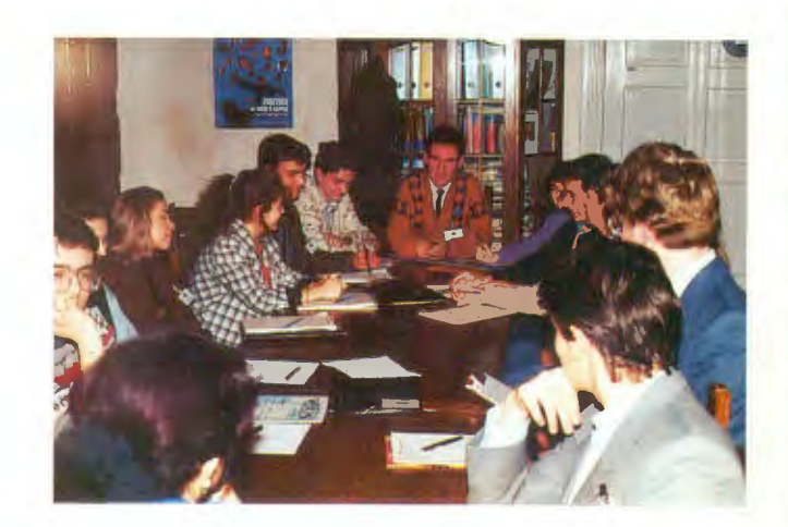
Workshop of the College of Democracy

GENDER DEMOCRACY is a project targeted at women's involvement in the public sphere and their access to decision making positions in society.