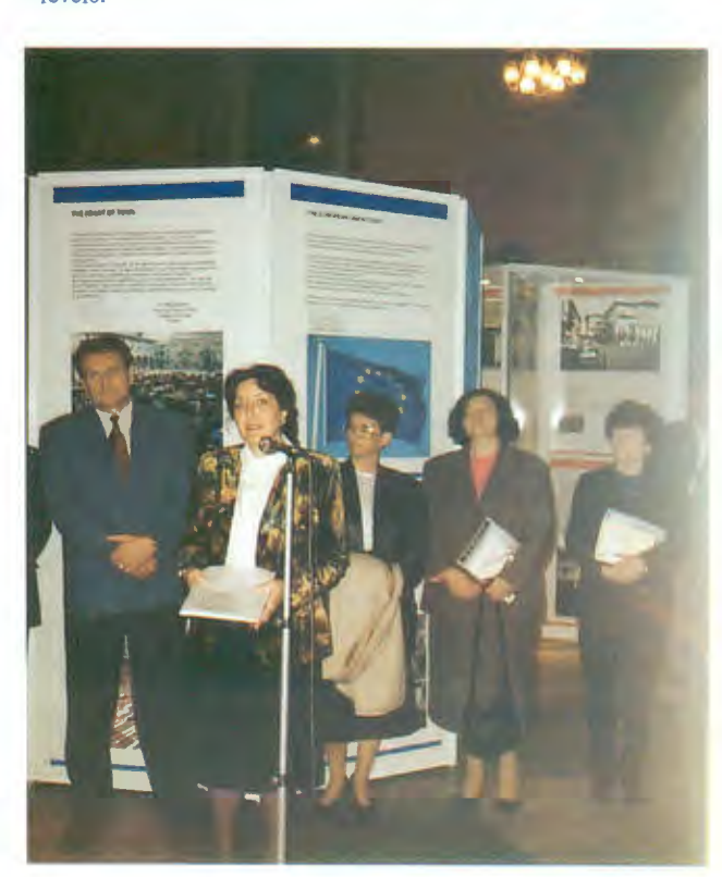
Opening Ceremony of the "Europe Day" 1995

Considering Romanian-Hungarian partnership as a guarantee of the stability and security on this zone, the PRO EUROPA League has functioned, even through moments of diplomatic freezing, as a forum for Romanian-Hungarian dialogue and has made a consistent and intense lobby at the highest political levels.