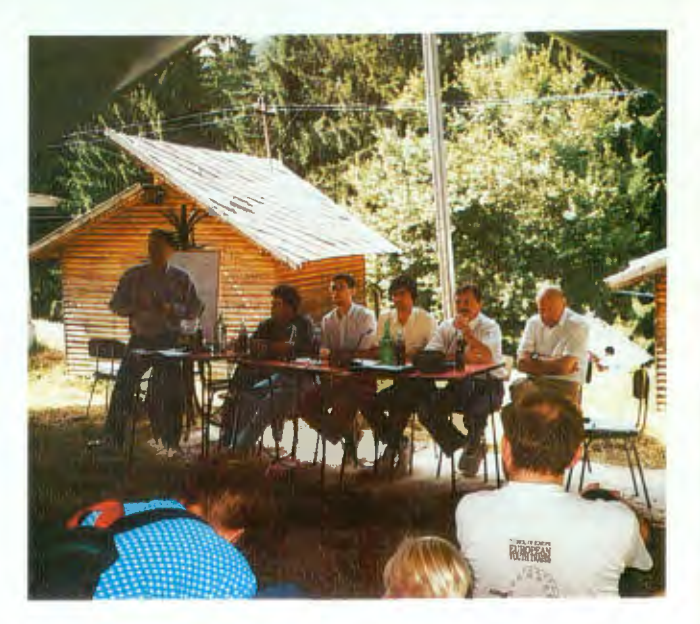
Bálványos Summer University

"Europe Days" in May, pleading for European values; "The Summer University of Bálványos" in July, an original forum of Romanian-Hungarian reconciliation; "The Intercultural Forum", a bi-annual debate, serving as a framework for alternative dialogue for ethnic, linguistic, cultural or religious communities.